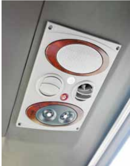
Air Conditioning Louvers and Reading Lamps

Reflecting the modern design technology, the Tonto 4 IVECO Euromidi 150 Euro5 combines outstanding ergonomics and appearance to provide a high level of comfort for the driver and passengers.