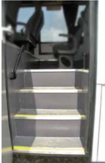
Driver and Passenger Entry which also includes electric step.

Louvers are installed over each passenger seat and can be aimed precisely. Ducts are larger for improved air flow.