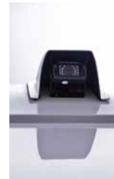
Reverse Camera Monitor on Dashboard Console