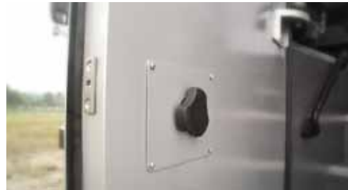
Out Swing Passenger Door