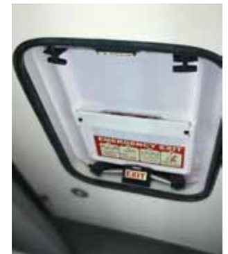
Roof Hatch Centrally located roof hatch provides an additional source of fresh air and acts as an emergency exit