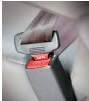
Passenger Seat Safety Belts Seat belts are essential safety features and are provided as standard equipment.