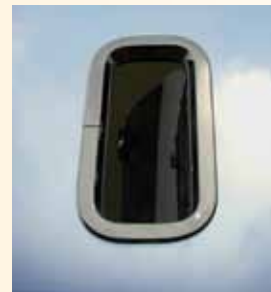
Drivers Porthole Window

Its concise lines not only increase the aesthetic feeling but also enlarges the interior. Modern body design ensures easy access for repairing, therefore making maintenance faster and more convenient.