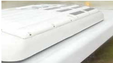
Integrated Air Conditioning Unit