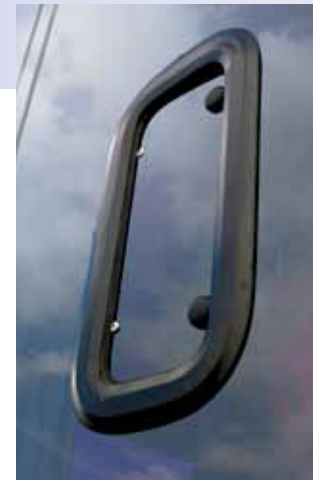
Drivers Porthole Window