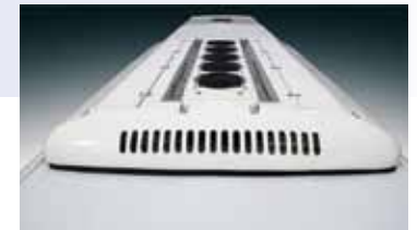
Intergrated Air Conditioning Unit