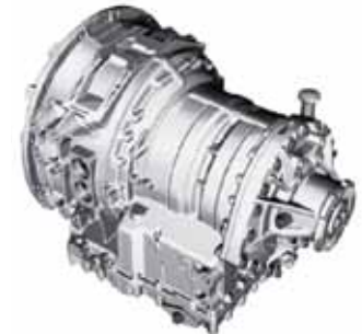
ZF Auto Transmission

All systems are designed for durability and reliability.