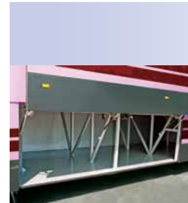
Straight Through Luggage Bins