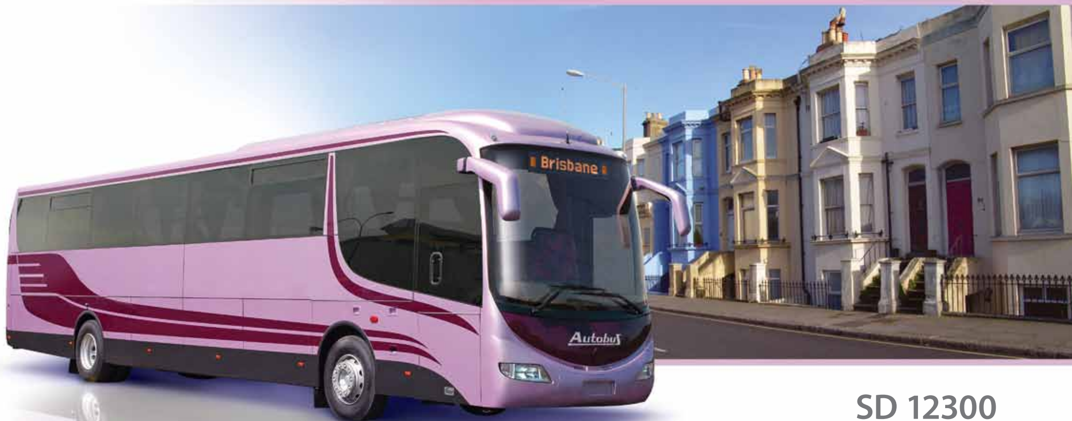
SD 12300 coach / school bus