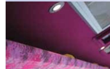
Interior Luggage Racks Integrated perfectly with the air conditioning louvers and reading lights.