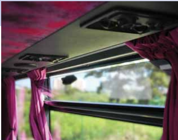
Hooper Windows (Australian made)

Its concise lines not only increase the aesthetic feeling but also enlarges the interior. Modern body design ensures easy access for repairing, therefore making maintenance faster and more convenient.