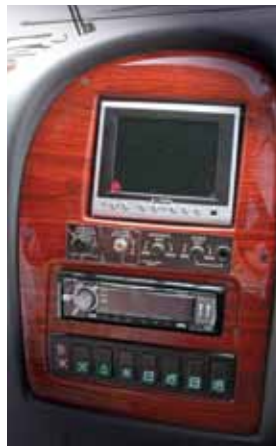
Radio / DVD Player with Microphone Arm